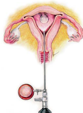
Top illustration: A cross section of the hysteroscope (camera) looking into the uterus. Bottom illustration: A hysteroscope viewing a polyp (growth) in the uterus.